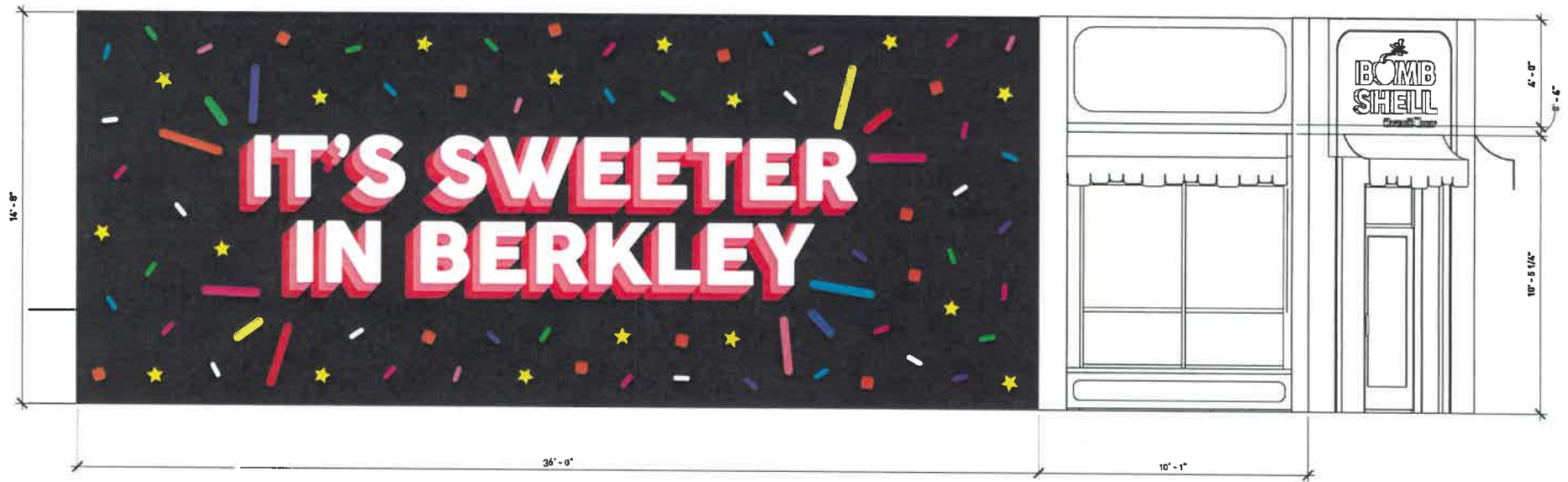
2 EXTERIOR ELEVATION - NORTH SCALE: 3/8" = 1'-0"