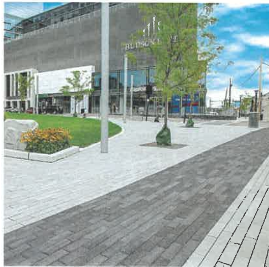
Specialty Paving Pattern