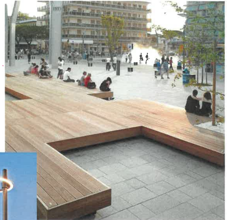
Wood Seating/Stage Deck