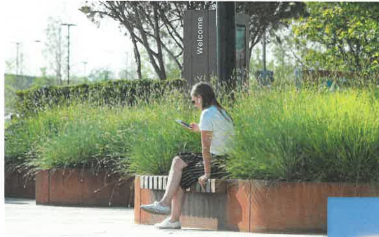
Raised Metal Planter with Wood Seating