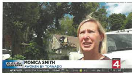
Local 4 News at 7AM

Streaming on ClickOnDetroit and Local 4+ from 7 a.m. to 8 a.m. weekdays.