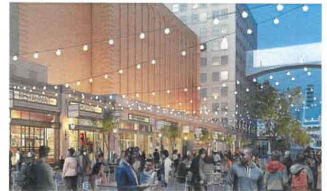
String Lighting Over Gathering Area