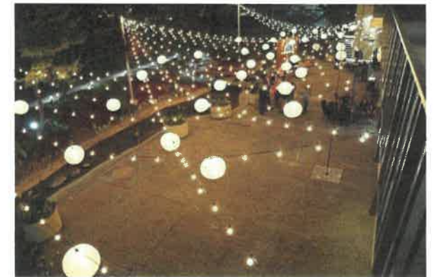
String Lighting Over Gathering Area