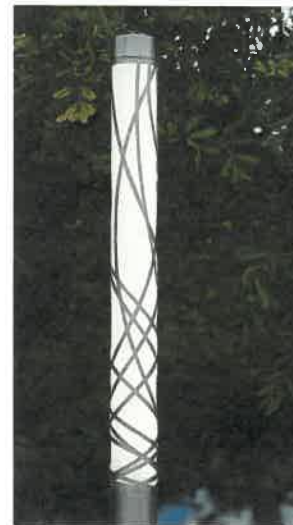
Decorative Pedestrian Lighting