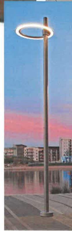
Decorative Pedestrian Lighting