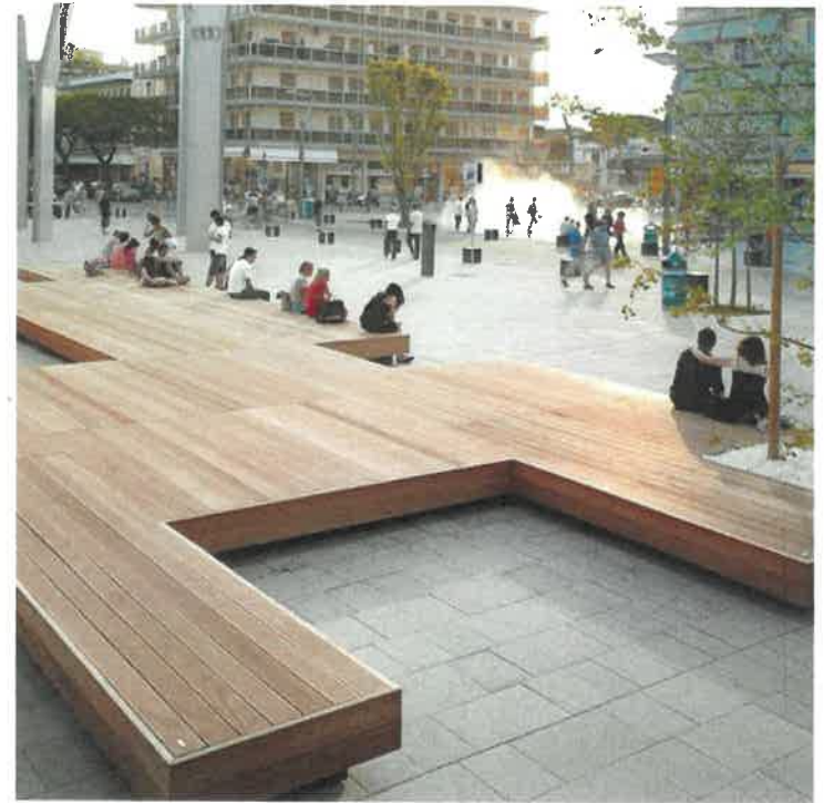
Wood Seating/Stage Deck