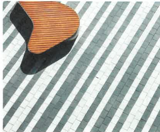
Specialty Paving Pattern