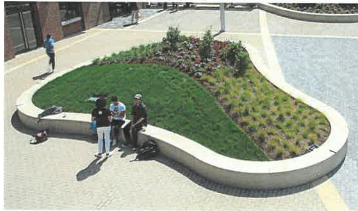
Raised Concrete Planter/Seatwall