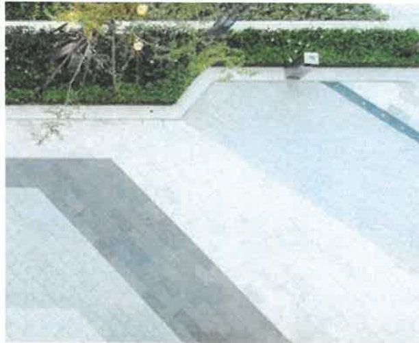
Specialty Paving Pattern