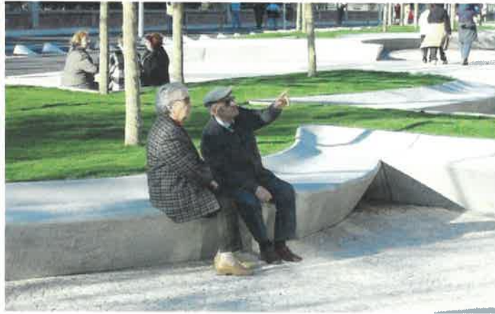
Raised Concrete Planter/Seatwall