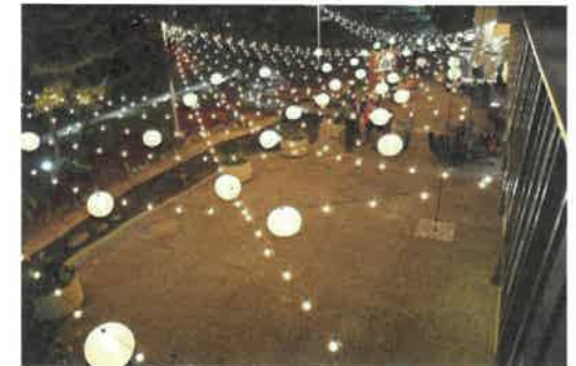
String Lighting Over Gathering Area