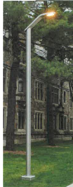
Decorative Pedestrian Lighting